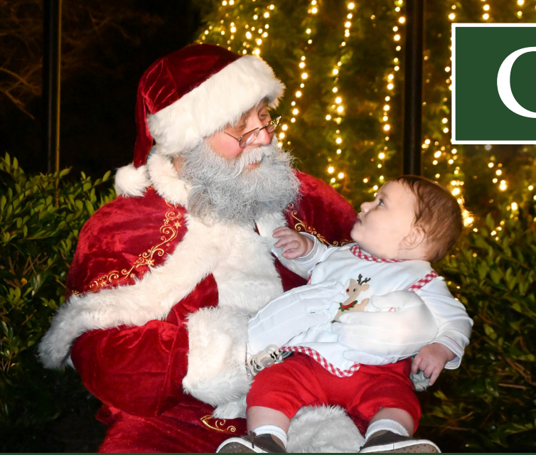
RIVER LANDING CHRISTMAS TREE LIGHTING - 5