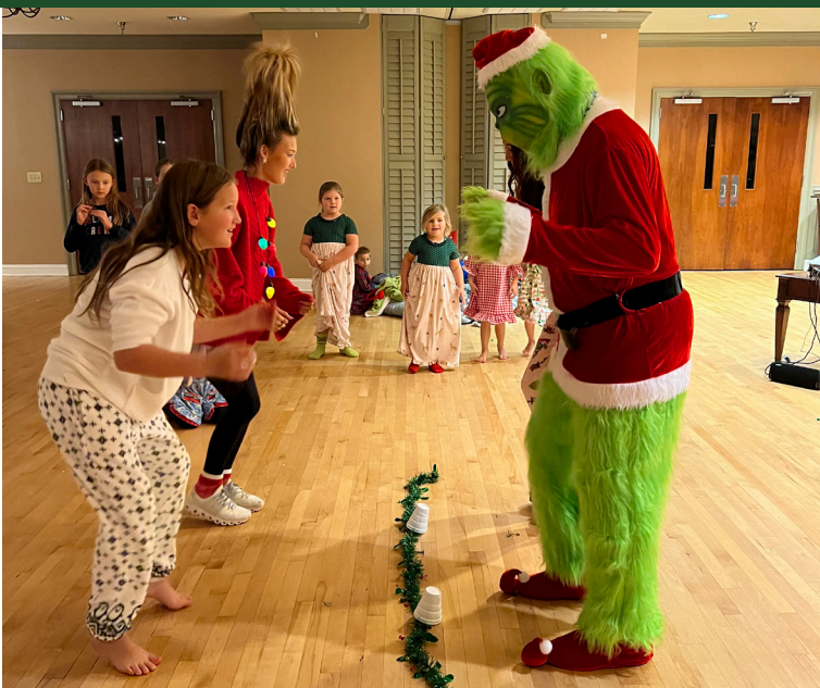
CHILDREN'S MERRY GRINCHMAS PARTY - 14