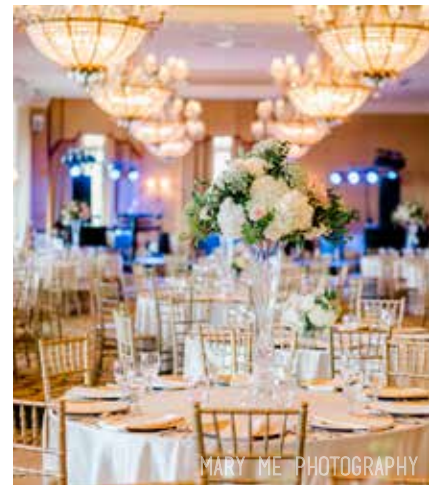
MARY ME PHOTOGRAPHY