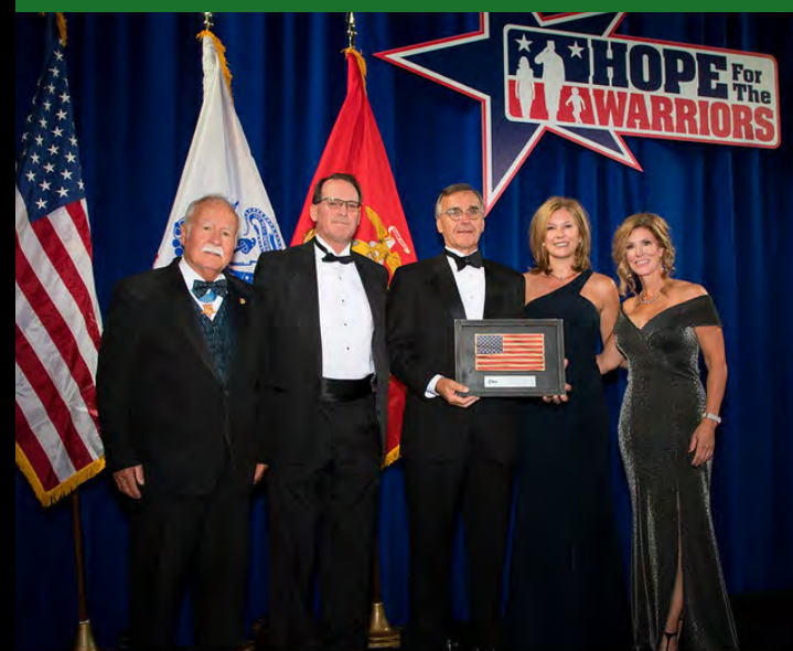
HOPE FOR THE WARRIORS - 12