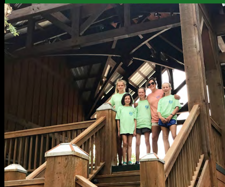
A LOOK BACK AT 2019 - 18