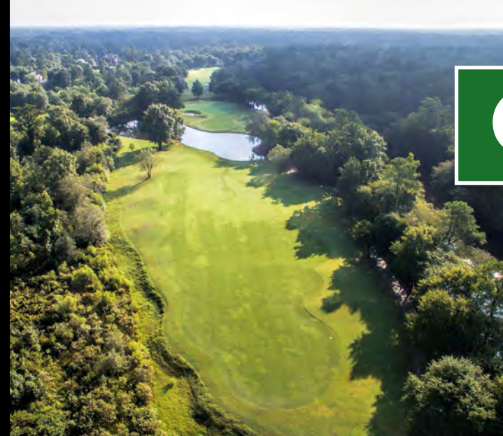
2019 GOLF COURSE OF THE YEAR - 8