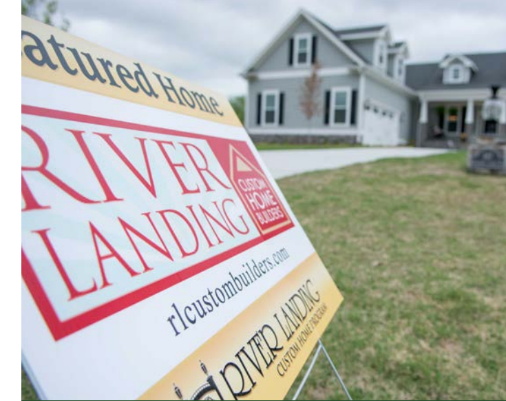
CUSTOM HOME PROGRAM 16