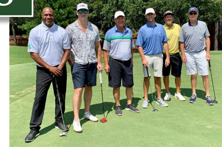
HOPE FOR THE WARRIORS 12

ON THE COVER Golfers stand proudly as the National Anthem kicks off the opening to River Landing's 2020 Hope for the Warriors Invitational!