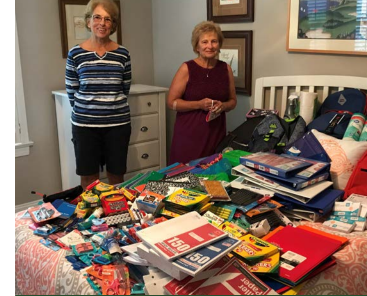
SCHOOL SUPPLIES DRIVE 15