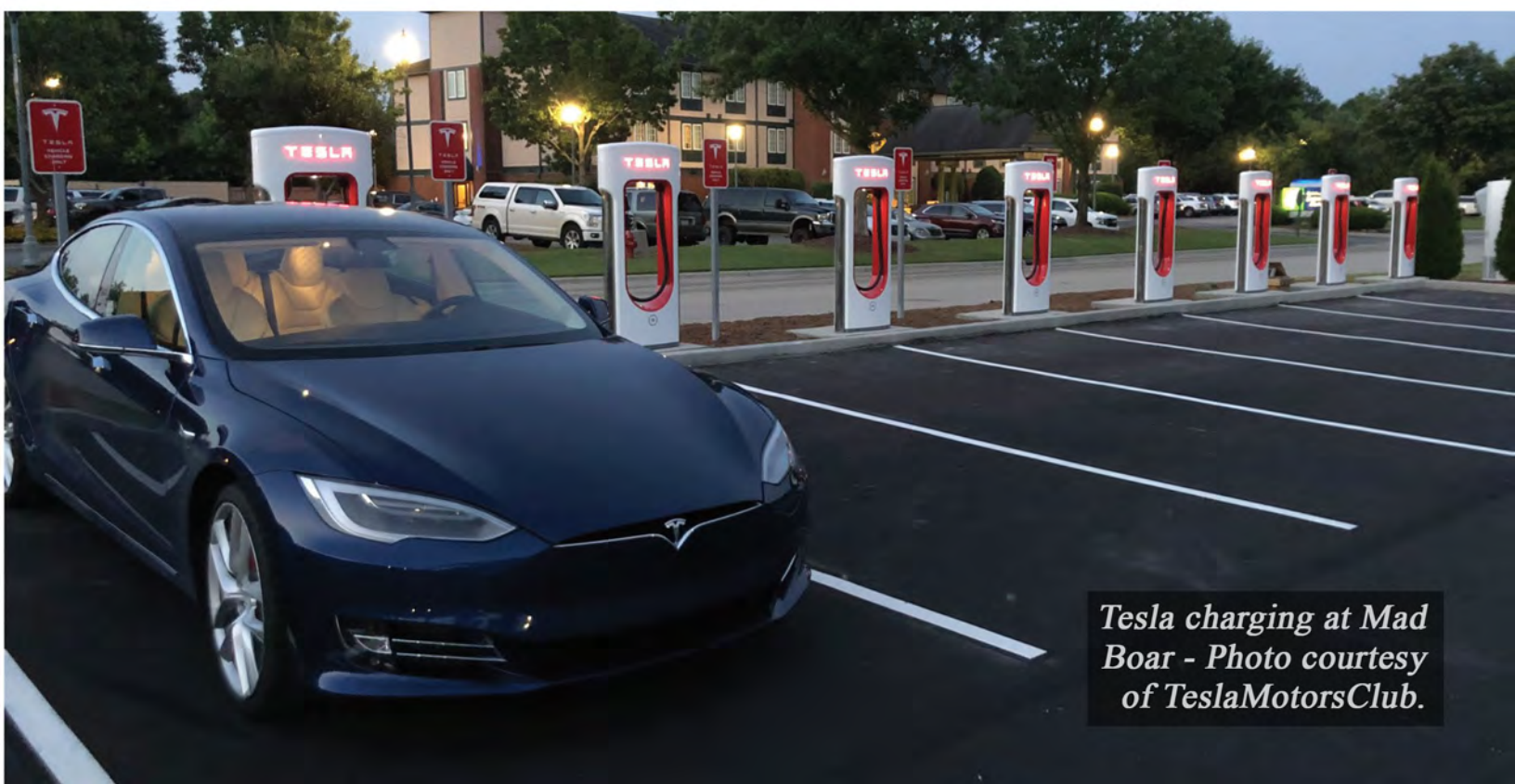
Tesla charging at Mad Boar - Photo courtesy of TeslaMotorsClub.