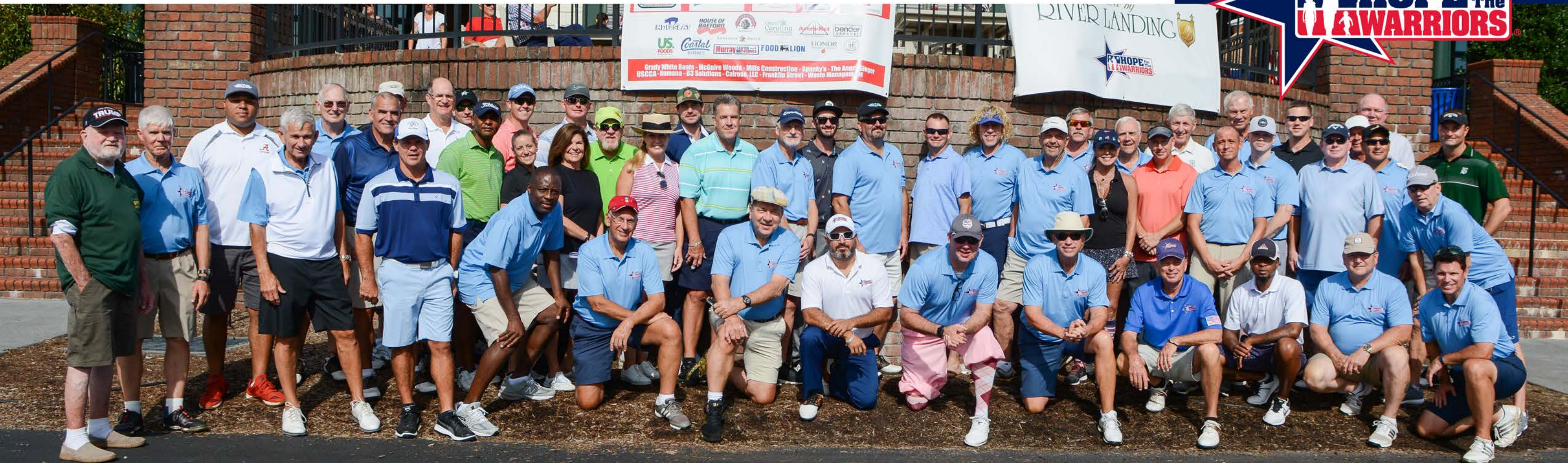
Flag Officers and celebrities for this year's Hope For The Warriors tournament pose for a photo prior to the start of play.