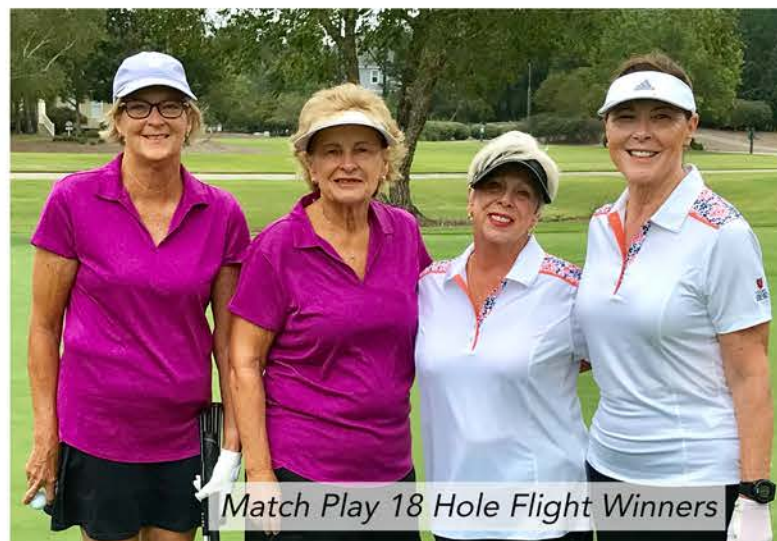
Match Play 18 Hole Flight Winners

Flight 1: Fiala/Masinick Flight 2: Dlugolecki/Maggio