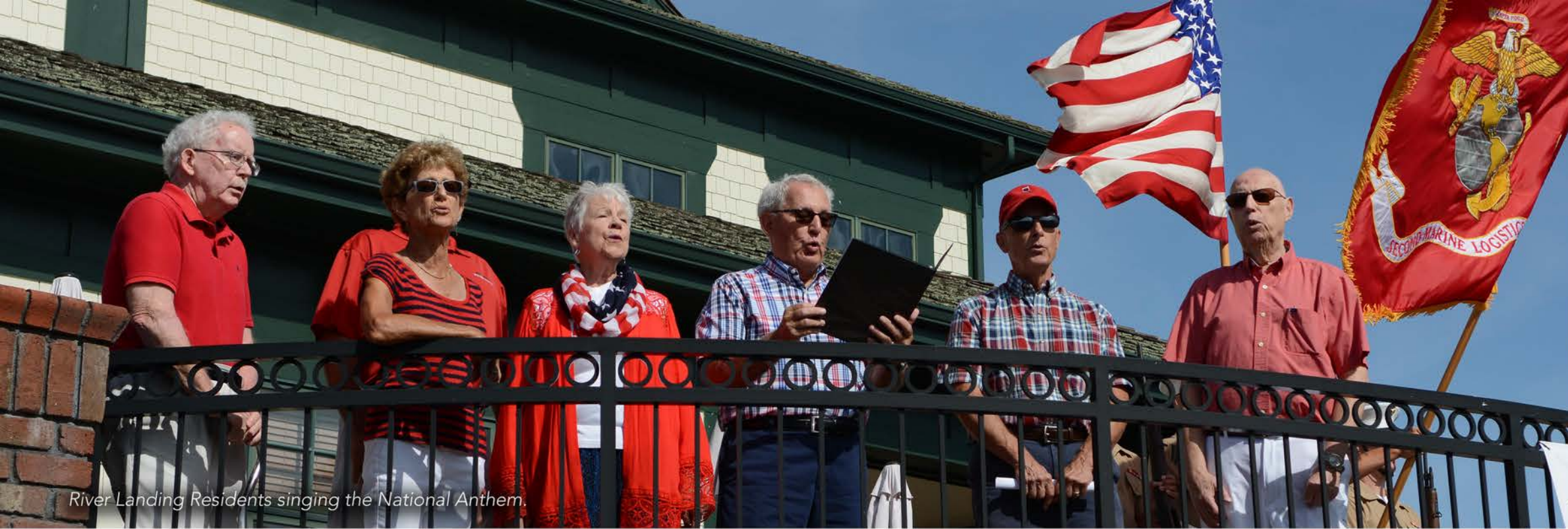
River Landing Residents singing the National Anthem.