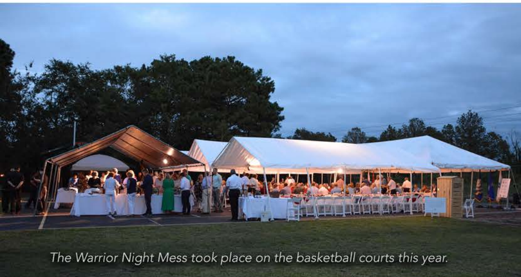
The Warrior Night Mess took place on the basketball courts this year.

River Landing's support of Hope For The Warriors has forged friendships that will last a lifetime. We are very thankful for all of the sponsors, celebrities, flag officers, volunteers, and participants who made this year and every year such a success. Our team has already started planning next year's tournament, which will take place on August 15-17, 2020 . Mark your calendars and make plans to attend!