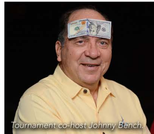
Tournament co-host Johnny Bench.