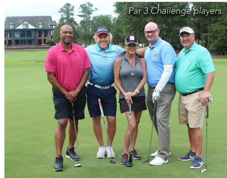
Par 3 Challenge players.