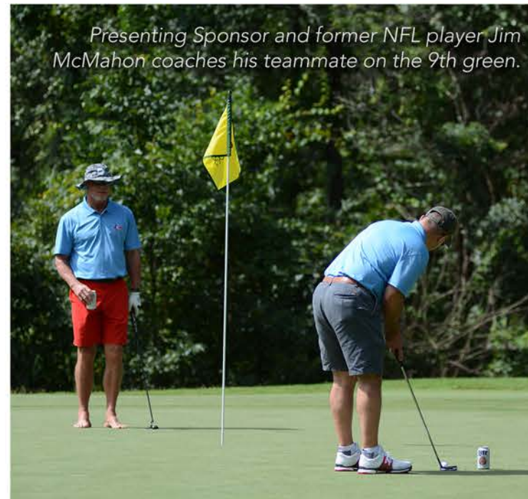
Presenting Sponsor and former NFL player Jim McMahon coaches his teammate on the 9th green.